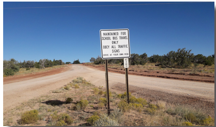
Apache County school bus road sign for C-301.

Houck, AZ - Apache County District 2 Supervisor, Alton Joe Shepherd would like to inform the community of Houck, AZ of road improvements on C-301; Silversmith Road and C-7250 West located on the north side of Interstate I-40. The work will comprise of 4.1 miles running from the west end of C-7250 West for 2.1 miles to C-301 and continuing on C-301 for 2 miles. This project will consist of culvert cleaning, sub-grade preparation, limestone placement and soil stabilization.